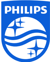
Econ Genie 5W/865 E27 220-240V 50/60Hz